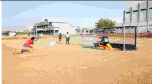
Hockey field at our college campus has 91.40 mts length and 55 mts width.