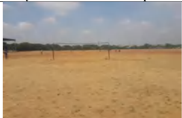
Football field at our college has 100 mts length and 60 mts width