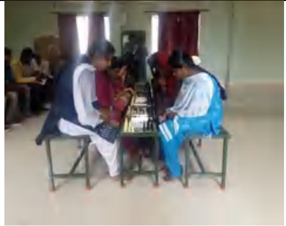
Our college Chess room.