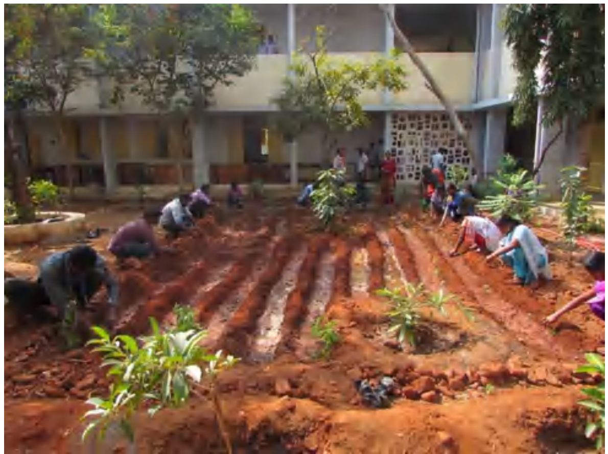
Nammalvar Herbal Garden Inaugurated on : 08.07.2018