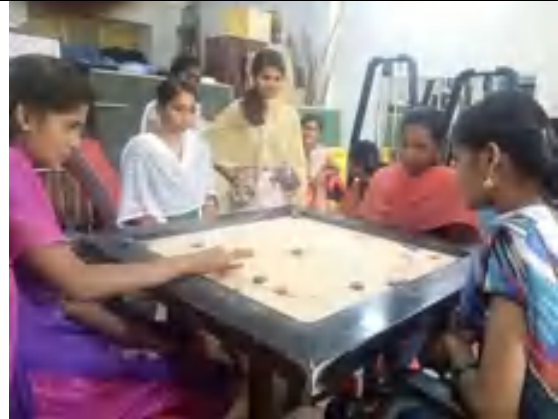
Our college Carrom room.