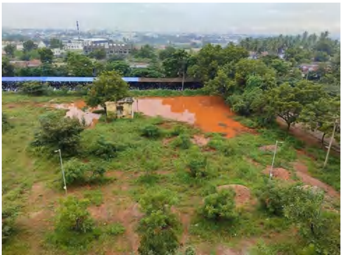
Pond created by NSS ( 19.06.2016 to 26.06.2016)