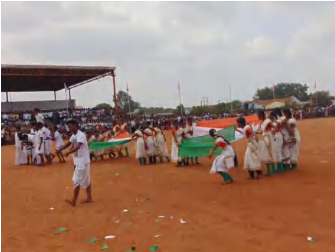
Independence Day celebration at Ground Auditorium