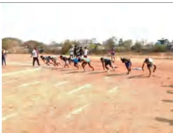
200 mts Athletic track laid at our college.