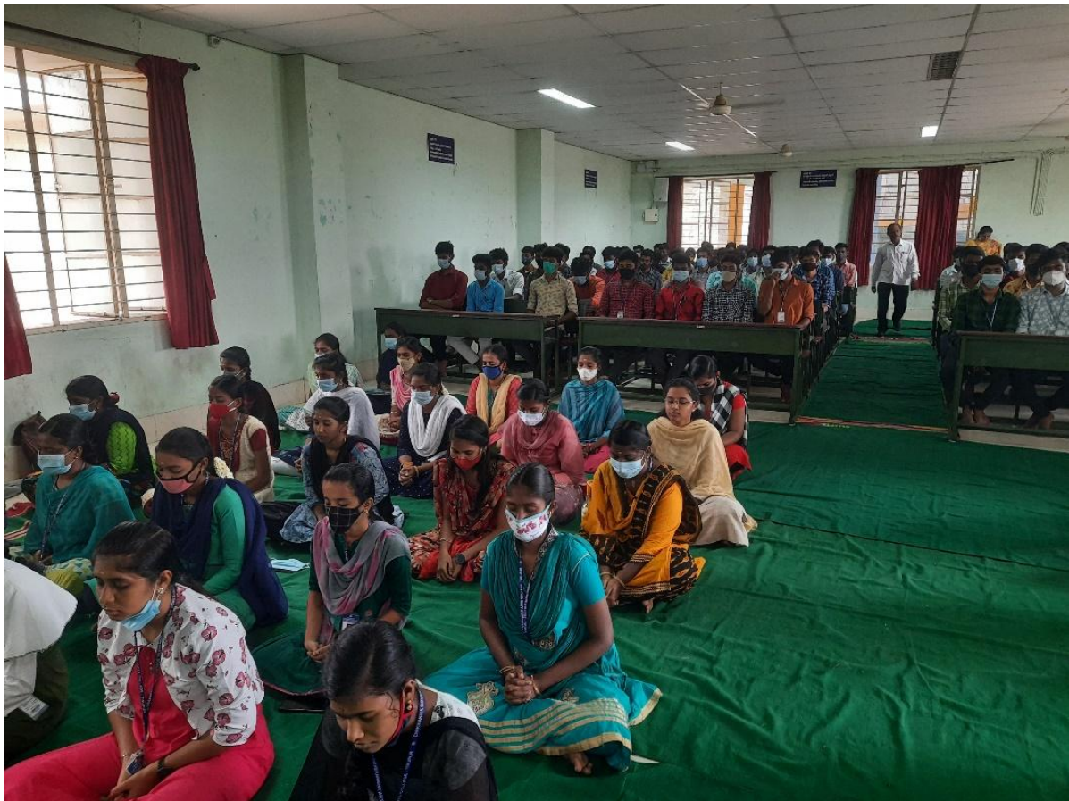
Yoga practice at open Auditorium (B block) & Kumaran hall