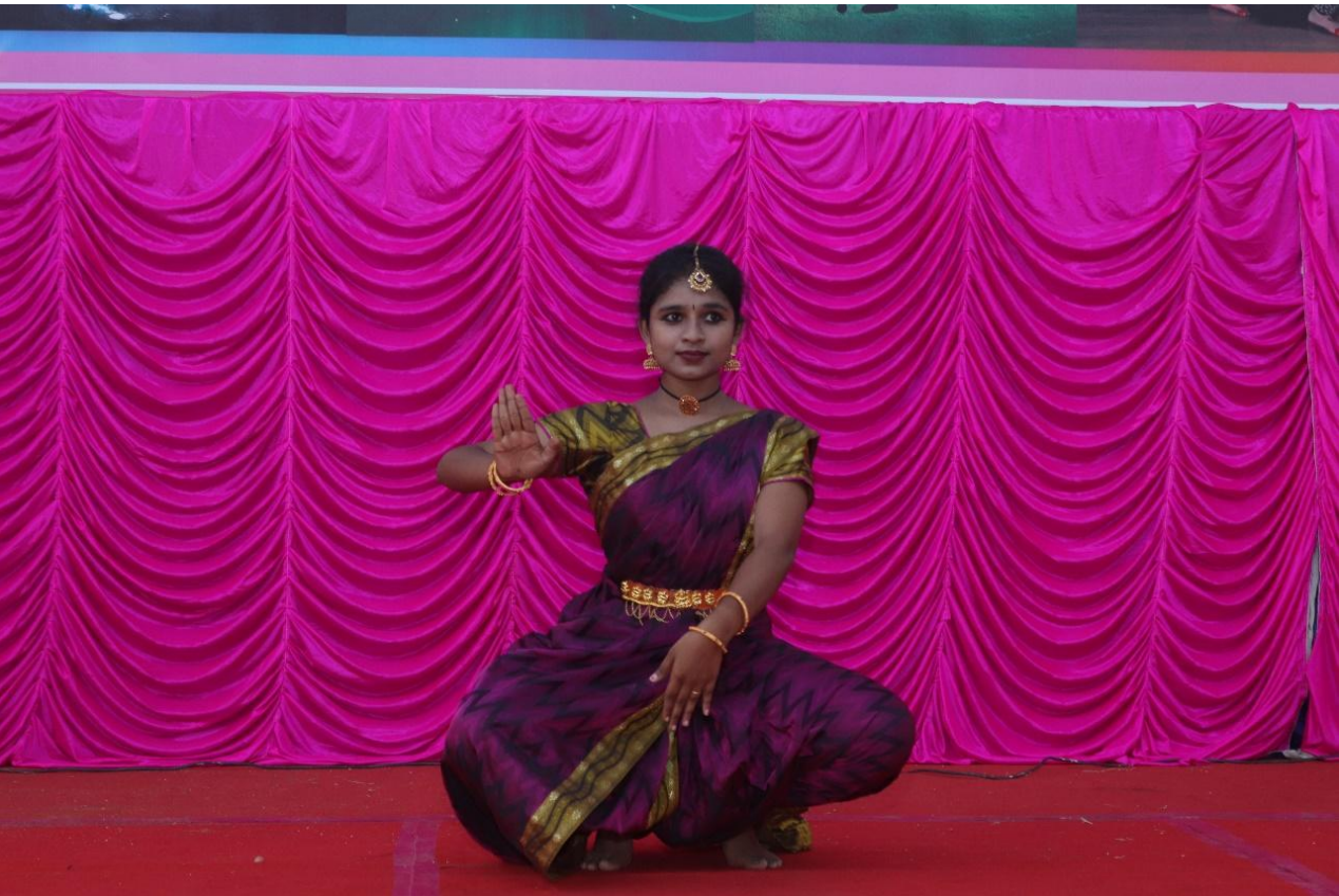
College day and sports day cultural activities