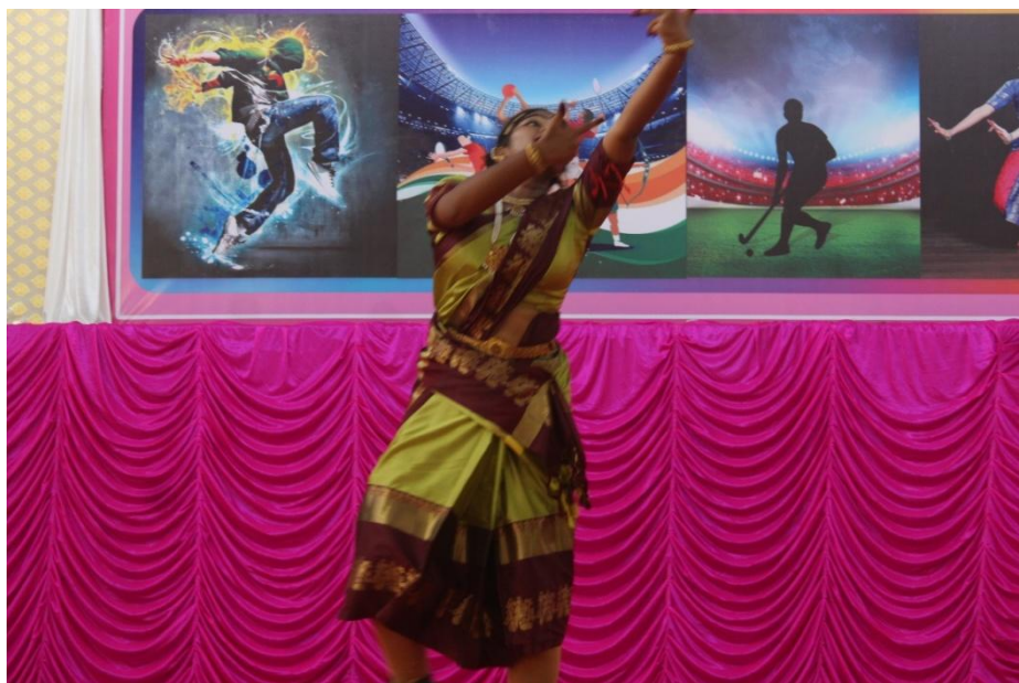
College day and sports day cultural activities