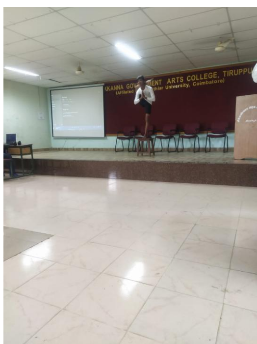
Yoga practice at open Auditorium (B block) & Kumaran hall