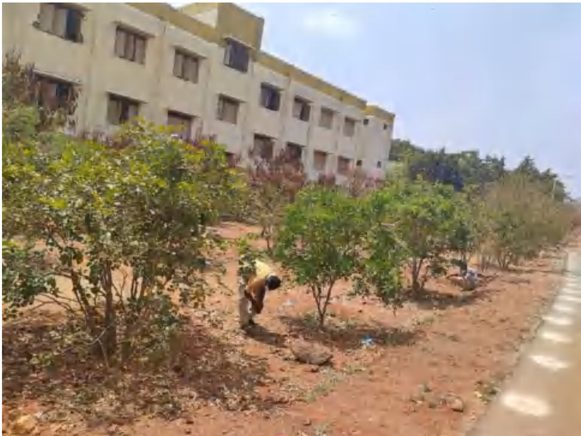
TiruppurKumaran Memorial Park Inaugurated by : 05.06.2019