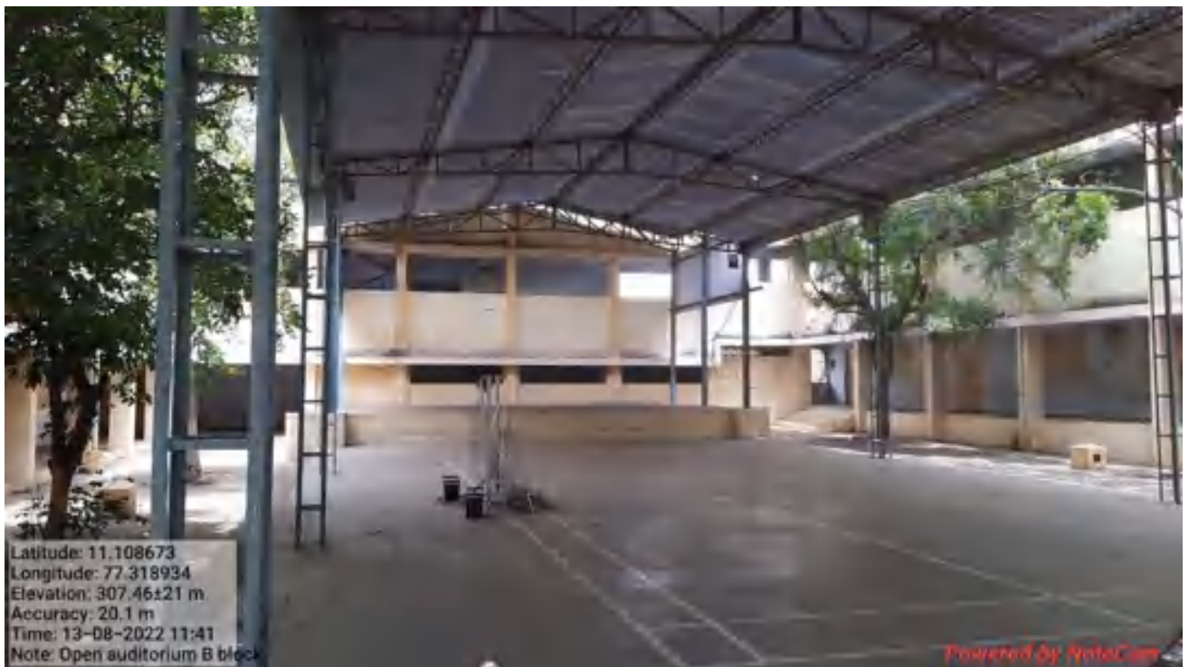
OPEN AUDITORIUM IN B BLOCK