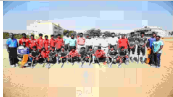
Our college has conducted State level Hockey tournament at our college campus. In which 8 men teams and 8 women teams has participated. In this tournament our college hockey team finished Runners – Up.