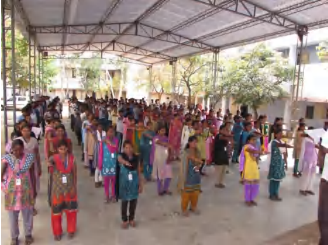
National Integration Day pledge at Open Auditorium