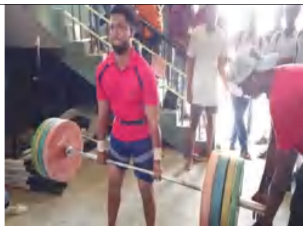
Our college has MOU with Sports Development Authority of Tamilnadu - tirupur unit. in which we used indoor for Weighth lifting competition and practice.