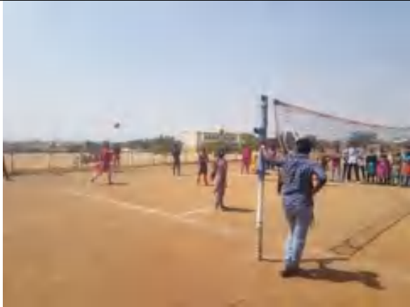
Volleyball Court at our college has 18.00 mts length and 9.00 mts width.