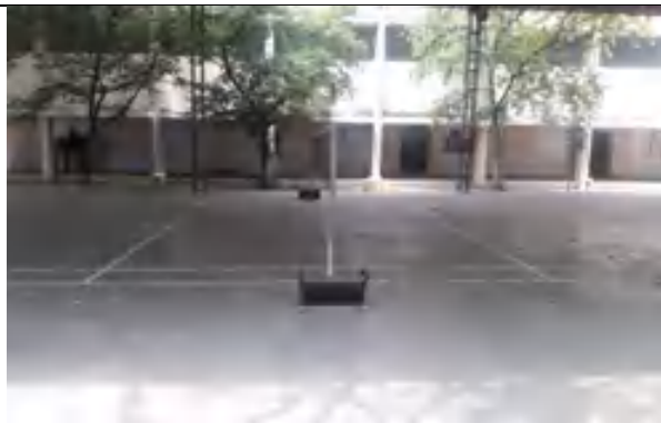
Badminton Court at our college has 13.40 mts length and 6.10 mts width.