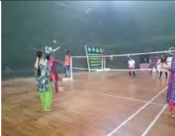
Our college has MOU with Sports Development Authority of Tamilnadu - tirupur unit. in which we used indoor for Badminton competition and practice.