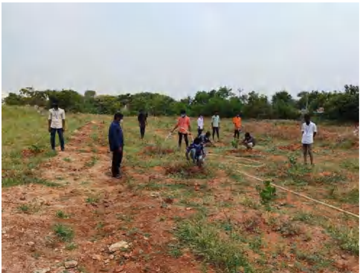
One Student One Tree program Inaugurated on : 21.09.2017